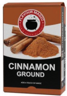
Cinnamon Ground 48 Units - 55 Grams