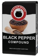
Black Pepper Compound 48 Units - 50 Grams