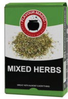
Mixed Herbs 48 Units - 18 Grams