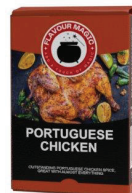
Portugese Chicken 48 Units - 75 Grams