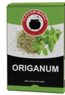
Oreganum 48 Units - 17 Grams