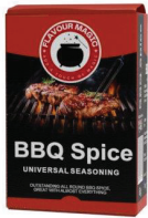
BBQ Spice 48 Units - 65 Grams