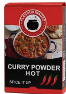
Curry Powder Hot 48 Units - 45 Grams