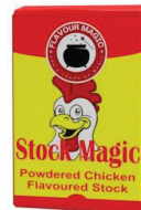
Stock Magic Chicken 48 Units - 100 Grams