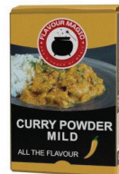
Curry Powder Mild 48 Units - 45 Grams