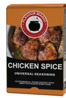
Chicken Spice 48 Units - 85 Grams