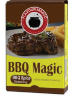
BBQ Magic 48 Units - 100 Grams