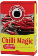
Chilli Magic 48 Units - 100 Grams