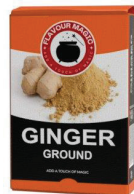
Ginger Ground 48 Units - 25 Grams