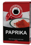
Paprika Ground 48 Units - 55 Grams