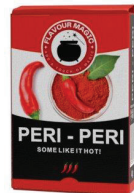
Peri-Peri 48 Units - 48 Grams