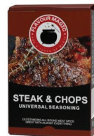
Steak & Chops 48 Units - 80 Grams