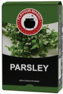
White Pepper Compound 48 Units - 50 Grams