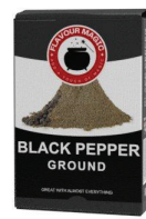
Black Pepper Ground 48 Units - 50 Grams