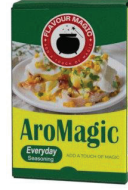
Aro Magic 48 Units - 100 Grams