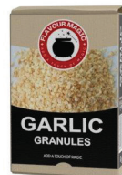
Garlic Granules 65 Units - 65 Grams