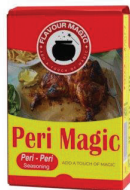
Peri Magic 48 Units - 100 Grams