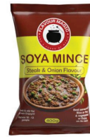
Steak & Onion 400 Grams