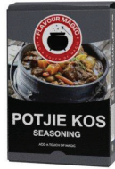
Potjiekos 48 Units - 80 Grams